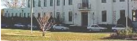
The Ainslie School Newsletter